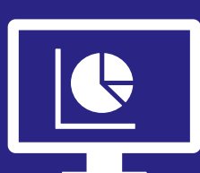
Graphical data dashboards.