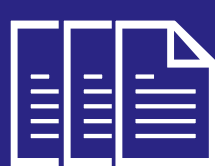
Unlimited budgets with version control.