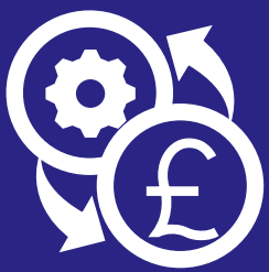
Budgeting and ERP System integration.

With greater insight, you can make more informed decisions to drive your overall business performance and build a competitive advantage.