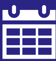
Unlimited rolling forecast capability.