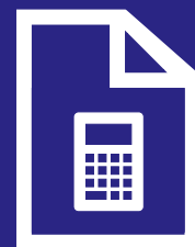
One set of financial statements.