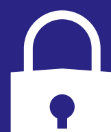
Flexible security and control.