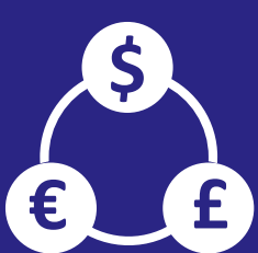
Leverage multi-currency & multiple conversion rates.