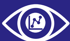
Increased insight into group financial reporting.