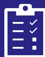
Support for task management and workflow.