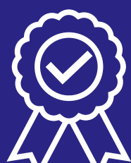
Meets GAAP and IFRS requirements.