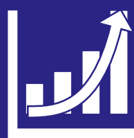
Quickly deliver financial results.