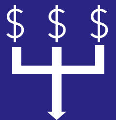
Consolidate multiple sets of accounts.