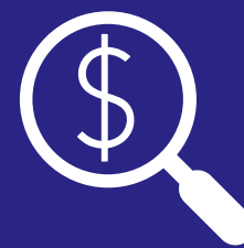
Analyse impact on cash flow.